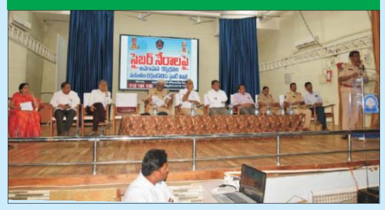
Cyber Mitra Programme at College of Veterinary Science, Tirupati

On 12<sup>th</sup> December' 2019 CVSc, Tirupati organized the Cyber Mitra programme at college auditorium. It is a yet another initiative to ensure the safety of women and children in the wake of rise in cyber crime. Deputy Superintendent of Police